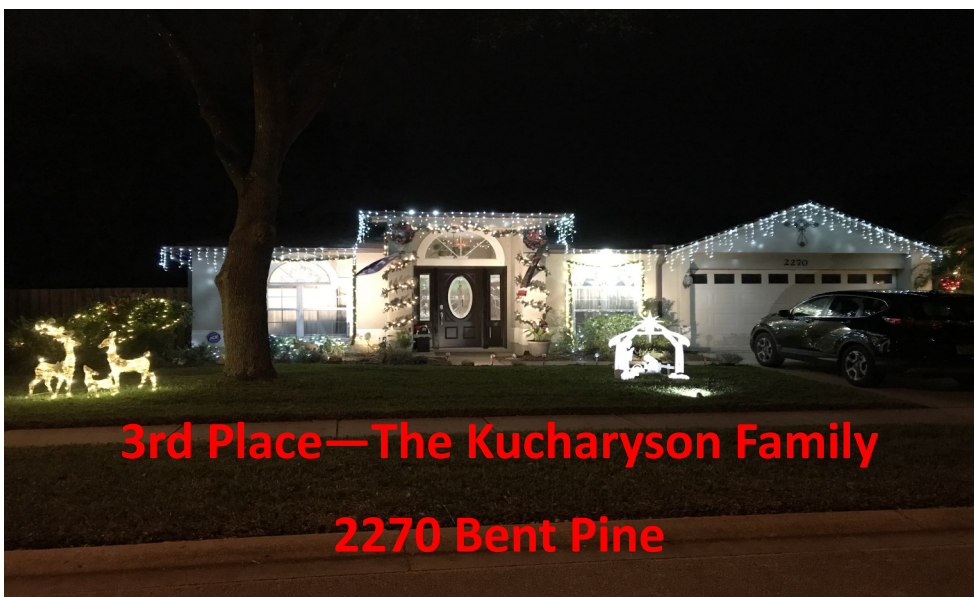
3rd Place—The Kucharyson Family 2270 Bent Pine