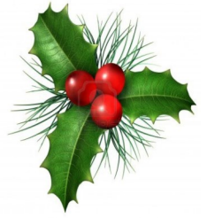
1st Place—The Disney Family—2540 Red Maple