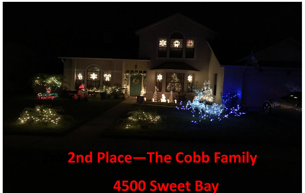
2nd Place—The Cobb Family 4500 Sweet Bay